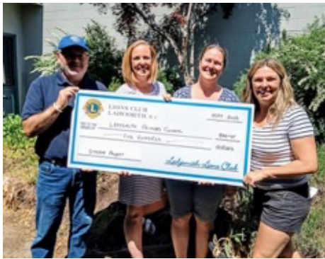
Ladysmith Lions Club, District 19L Recycling Project Fundraising partner Encorp Pacific, Canada Club is funding Stream Project-Elementary School.

As the Environment Chairs circulate through our districts, speaking to Lions, scanning MyLion, Facebook pages and websites, these are some of the projects we see.