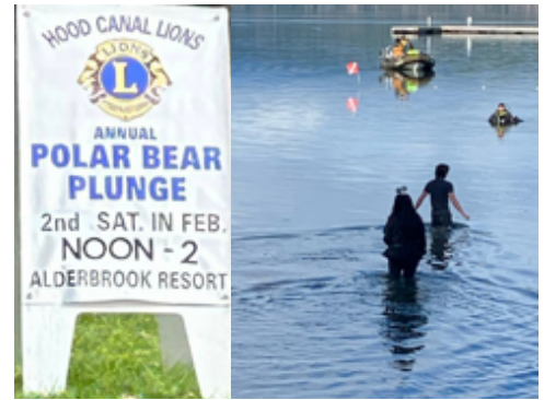
Hood Canal Lions. Annual Polar Bear Plunge. Food, prizes, a band playing entice community members to take the plunge for year 14.

Team of Lions has applied to be on the Presentation Stage in Melbourne. Topic-Great Environment Service. MD 19 Clubs include Nelson, Camas, Lynn Valley, Clallam Bay Sekiu, along with Wisconsin & Georgia Lions.