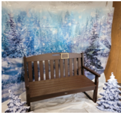
Spanaway Lions Recycle Sheet Plastic with Trex Bags-to-Benches. Presented bench to local church.