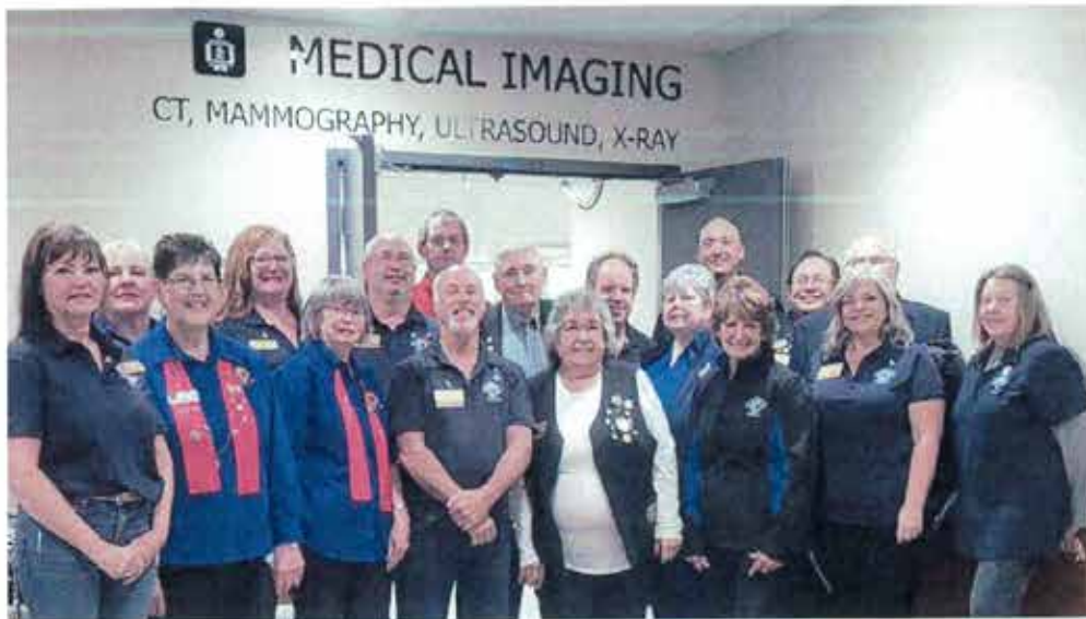
A ribbon cutting was held earlier this week to celebrate the amazing work undertaken by area Lions Club members. Clubs from Chilliwack, Agassiz-Harrison and Hope came together to purchase a state of the art mammography suite at Chilliwack General Hospital at a cost of $409,400, of which $129,000 involved a grant from Lions Clubs International Foundation. The three new machines will serve over 70,000 people in Chilliwack and the surrounding communities well into the future.